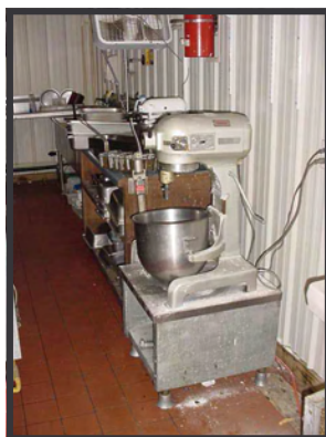
Stand Mixer with attachments